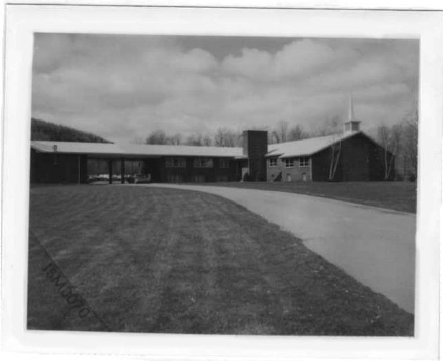
South Apalachin Baptist Church