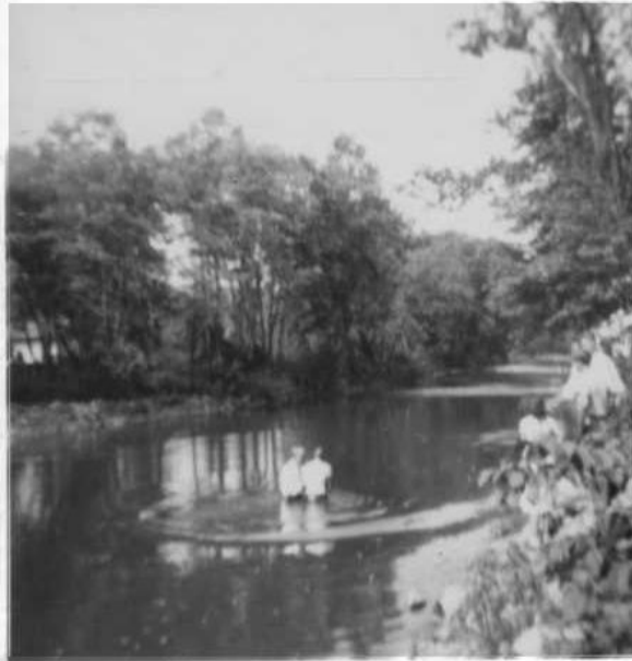
Baptism Performed in South Apalachin Creek